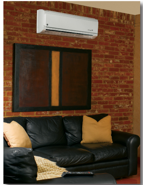
The indoor units can be suspended from a ceiling, mounted flush into a drop ceiling, or hung on a wall.

DHPs have been around for over 30 years and are used widely throughout the world.